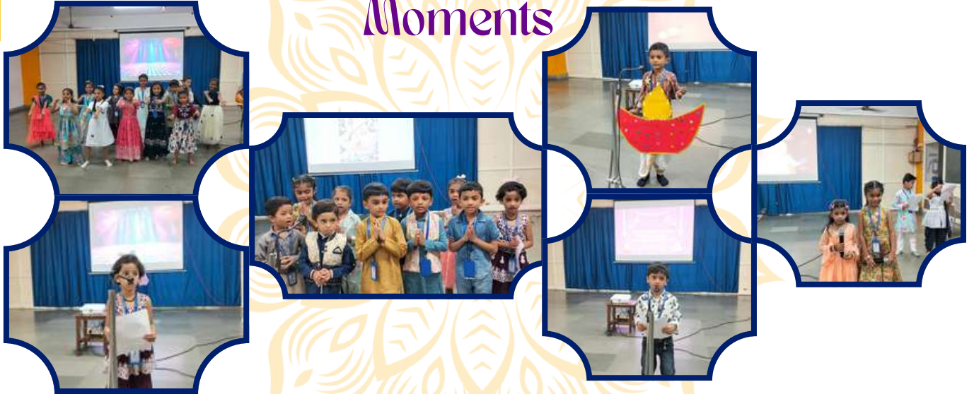
Mass Assembly: Diwali Celebration & its significance (Grade 1 Venus)